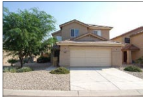
1325 E Saguaro Trail. LENDER OWNED! 4 bedrooms, 3 baths, loft. Great room plan with one bedroom and bath downstairs. Cabinets in laundry. MLS 4052590 $110,200