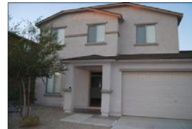
2528 E Meadow Creek Way, Queen Creek. $99,900! 3 bedrooms, 2.5 baths, 2292 sf. Built in 2005. Bank owned. Immaculate and located on a greenbelt. BARGAIN! MLS 4051836