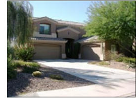
2977 E Vermont Drive. 4 car garage! 3371 sf, 5 bedrooms, 3.5 baths. Built in 2003 by Morrison. Pool, above ground spa, water features. Corian counters, gas cooking. MLS 4056106