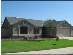
1867 E Jasper Dr. Darling, remodeled 3 bedroom, 2 bath home in Chandler! 1410 SF, all new stainless steel appliances. Great neighborhood. Under $200K! 4011579