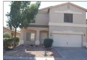
935 E Cowboy Cove Trail. Johnson Ranch beauty! Lightly lived in and elegant but comfortable. Spacious kitchen with walk-in pantry. 3 bedrooms, 2.5 baths. MLS 4058878

Did you know... You can search the MLS through our website?