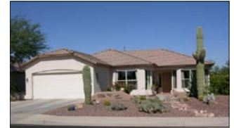
3540 E Torrey Pines Ln. Sharp Day-break model! Front and back face the golf course at Solera! Gated community, 2 bedrooms, 2 baths, 1680 sf, built in 2001 by Pulte. MLS 4045598