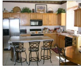
1319 W Enfield Way. $234,900. New carpet and paint. 1627 sf, 3 bedrooms, 2 baths, covered patio, 2 car garage. Kitchen island, micro and pantry. MLS 4044745