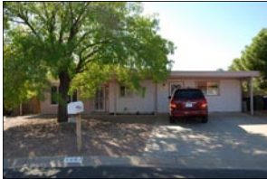
1052 S 72nd Way. Apache Country Club Estates. 4 bedrooms, 2 baths, 2240 sf. Cul-de-sac lot, new carpet and paint, fireplace, 2 AC units. Washer, dryer, refrig. MLS 4051005