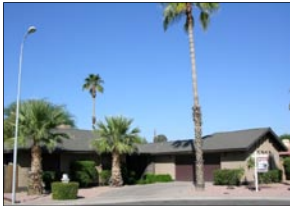
1382 N Orval Circle in Chandler. Custom slump block home. 1979 sf, 3 bedrooms, 2 baths, 2.5 car ext garage, new carpet. Great room w/frpl. $249,900 #4058046