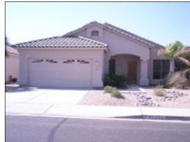
22838 N 24th Pl. Phoenix. Built in 1996 by Pulte Homes. 1720 sf, 3 bedrooms, 2 baths, pool, 2 car garage. Mountain views. Kitchen pantry and island. Master split. MLS 4051281 Bank owned