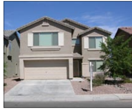
40938 W Hayden Rd. 4 bedrooms, 2.5 bathrooms, 2276 sf home for $129,900! Preforeclosure. Loft, upgraded carpeting, black appliances, formal living and dining. 4031172